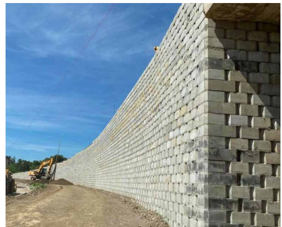
Overview of the installed segmental block wall system

The Bago-Aplaya Section facing Davao Gulf towards Talomo is an elevated highway with a 90 degree vertical slope on both sides. The contractor required the embankments to be stabilized and reinforced effectively.