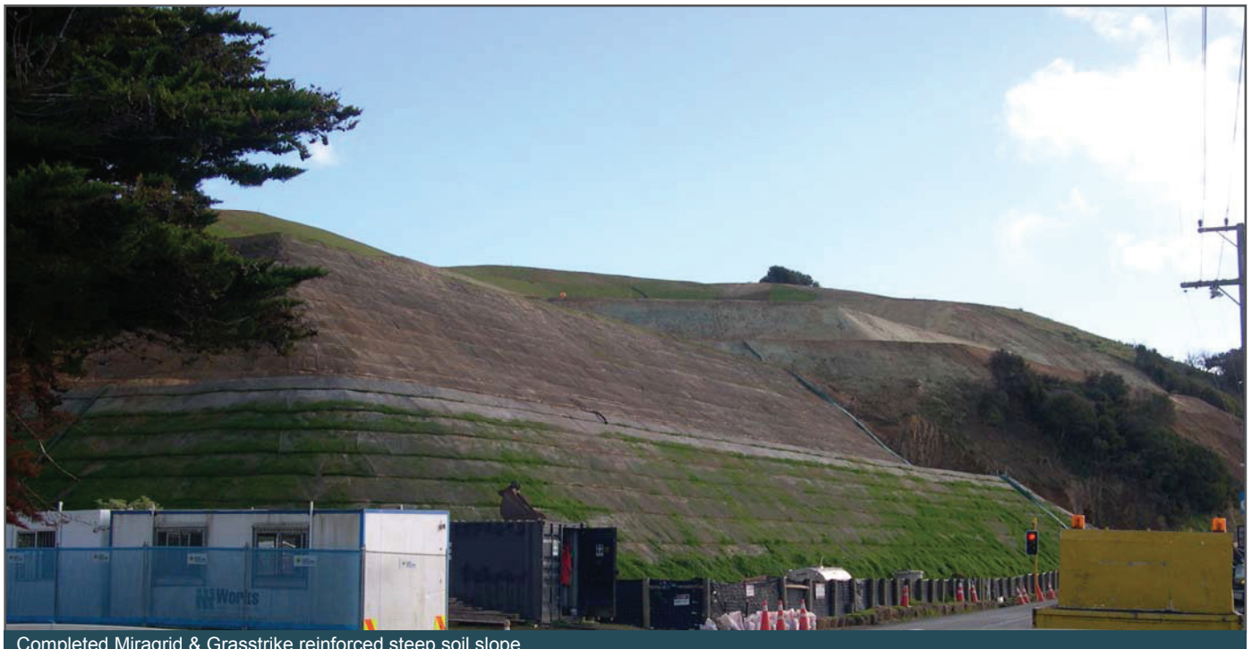
Completed Miragrid & Grasstrike reinforced steep soil slope