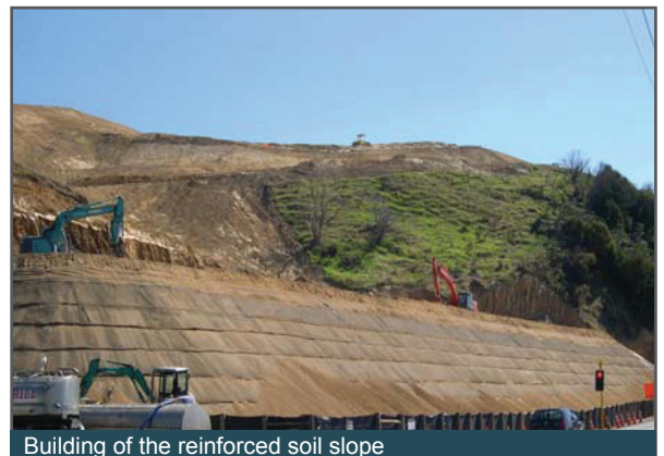
Building of the reinforced soil slope