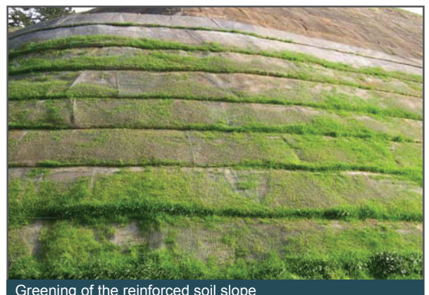
Greening of the reinforced soil slope