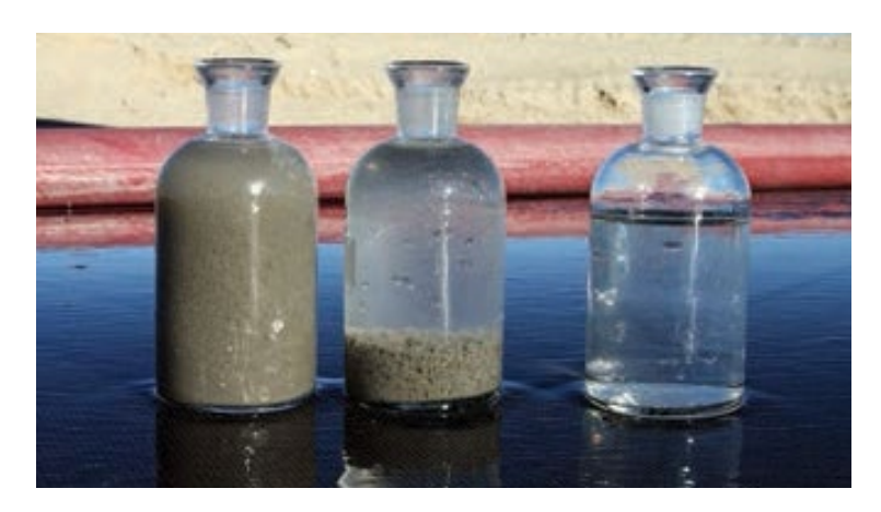
Sludge before (left) and after (right) treatment with GEOTUBE <sup>®</sup> dewatering technology

GEOTUBE * containers can be customized to fit available space and be easily removed when dewatering is complete. Dewatered solids can be safely stored on site, reutilized to build dykes and berms, or disposed of in a landfill without expensive dredging or transportation.